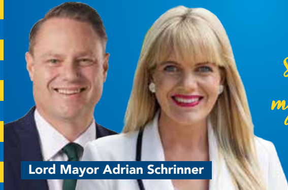
Lord Mayor Adrian Schrinner