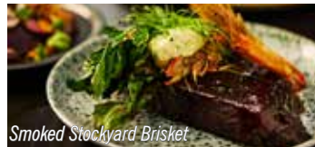
Smoked Stockyard Brisket

The Arsonist restaurant hosted a special charity dinner in March to support those affected by the Brisbane floods. The Arsonist staff donated their time with the dinner featuring a live auction with some fantastic items donated by their suppliers and the local community. Proceeds will go to Brisbane flood victims.