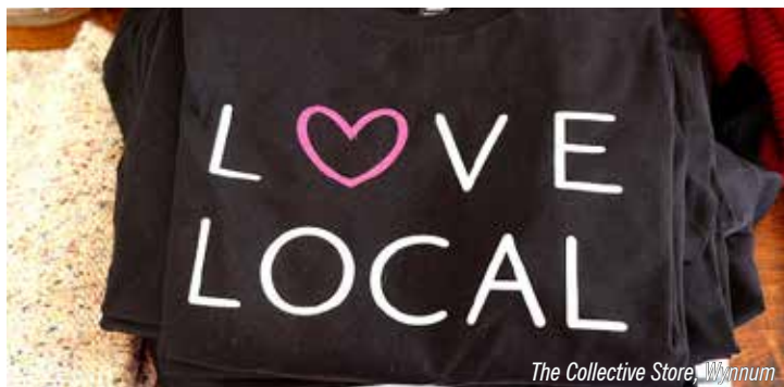
The Collective Store, Wynnum