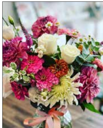
Abundance Autumnal Posy Jar Flowers on Cambridge